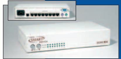
Smart CAT5 Switch, 8 Ports