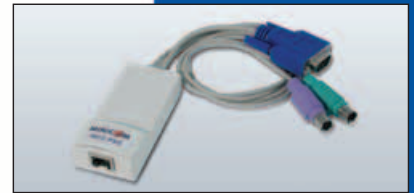
RIC PS/2 Cable (also available for SUN & USB)