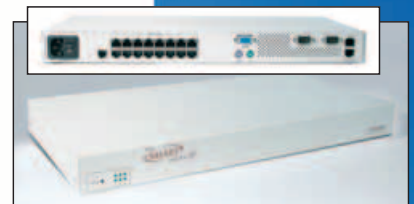
Smart 16 IP Switch