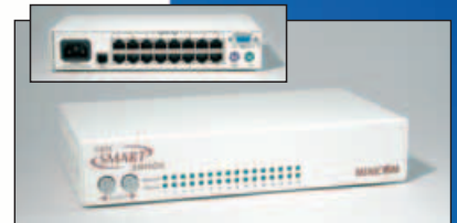
Smart CAT5 Switch, 16 Ports